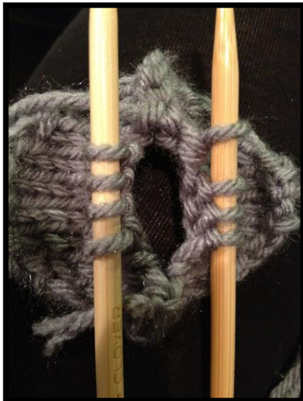
Figure 5: Bind off 4 stitches from each needle. You will have 8 stitches remaining, 4 on each needle.

Doing the same thing you did on the other side, bind off 4 stitches from each needle. You will now have 8 stitches remaining, 4 on each needle (Figure 5).