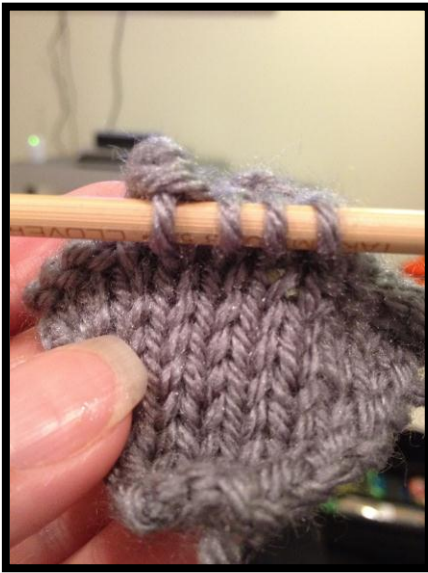
Figure 6: Holding 2 needles together, knit stitches together. You will have 4 stitches remaining.

Again, holding the two needles together, knit the stitches together (do NOT bind off). You will have 4 stitches on your needle (Figure 6).