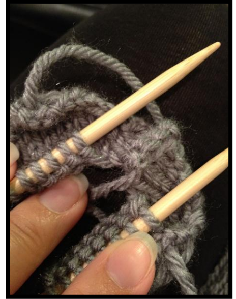
Figure 3: You will have 4 stitches from each needle bound off on one end.

Turn the piece so that the bound off stitches are now on the left side (Figure 4).