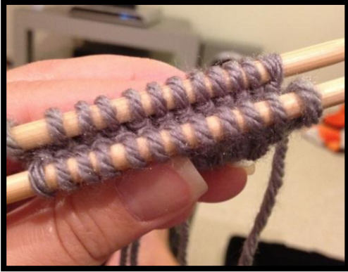
Figure 1: Hold two pieces together with the WS/purl sides against each other on the inside.

Holding the two pieces together, use the tail you left on the first piece you made to bind off 4 stitches (Figure 1, 2, and 3).