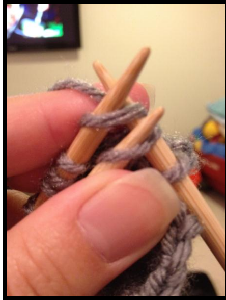
Figure 2: Bind off 4 stitches by knitting 2 stitches together (one from each needle) 2 times, then passing the first stitch over the second stitch.