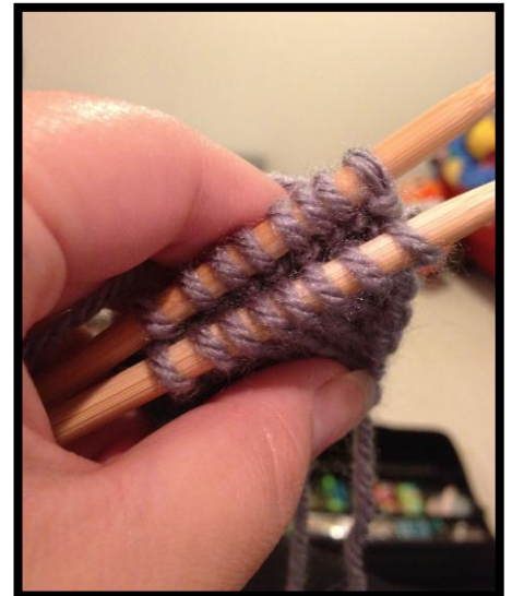
Figure 4: Turn the piece so that the bound off stitches are on the left.